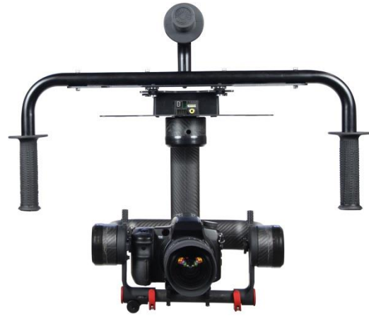
The Halo 2000 by Photo Higher is a three-axis camera stabilizer system made from 100 percent carbon fiber. The stabilization is provided by maxon motors and servo controllers.

Power consumption is an important consideration for unmanned aerial vehicle (UAV) applications. With higher power density and higher efficiency, maxon brushless DC servo motors offer lower energy consumption than other motors, allowing the UAV to remain airborne for longer periods of time. After numerous trials with a variety of drive units, including the use of an angular gearhead that turned out to be too heavy, an ideal solution was found: the maxon EC 32 flat, a brushless DC servo motor that drives the gimbals directly. This customized drive is flat and compact while still fulfilling the speed and torque requirements. Most importantly, the output has zero backlash, making these drives a perfect solution for camera gimbals. With the new design, the end user can always adjust the gimbal and balance the center mass of the entire system, irrespective of the camera brand or model. With a balanced center of mass, fast acceleration and quick response can be achieved with minimum effort from the DC servo motors.